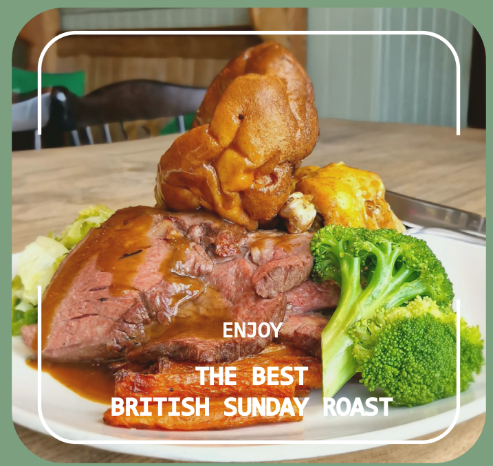
*Be sure to book in advance in order to avoid dissapointment!